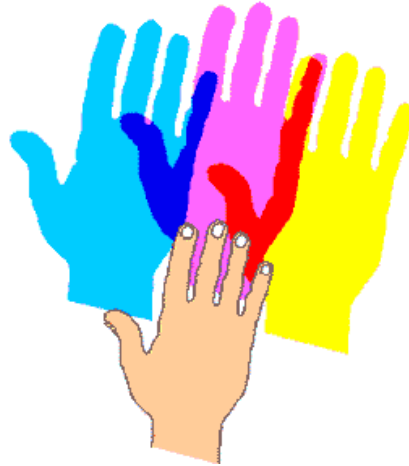
Colored shadows. The yellow hand is the one that waves to you most slowly.

be free of any serious spatial or temporal responsibilities in vision.")