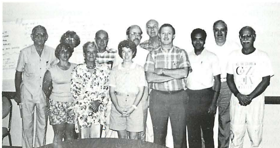
Long Range Planning Committee meeting in Fredricksburg, VA August 24-25, 1991